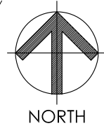
MEMORIAL OPTION D FLOOR PLAN SCALE: NTS